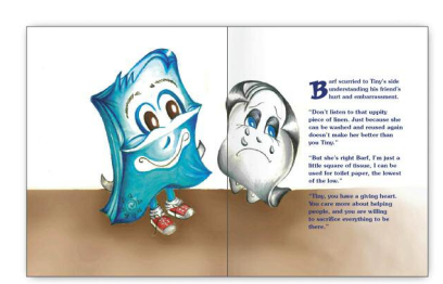
Hardback edition, 40 pages, includes heartwarming scenes with the endearing characters teaching and encouraging each other.